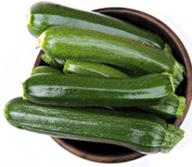
Zucchini ( Abobrinha )