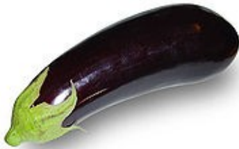
Eggplant ( Beringela )