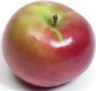
Apple ( Maçã )