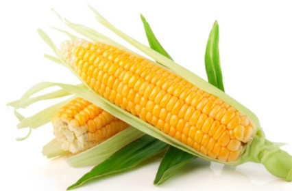
Corn ( Milho )