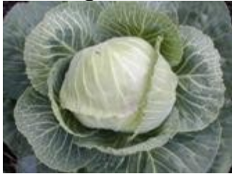
Cabbage ( Repolho )