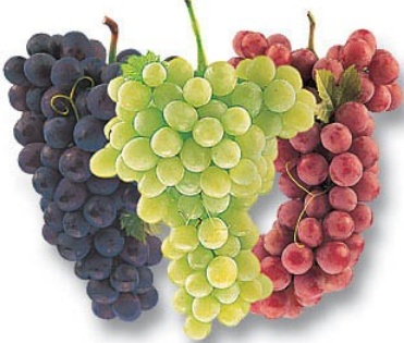
Grape ( Uva )