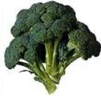
Broccoli ( Brócolis )