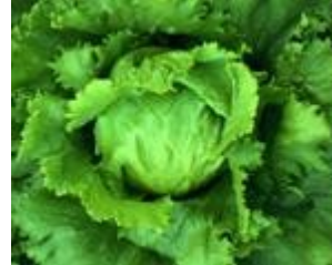
Lettuce ( Alface )