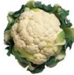
Cauliflower ( Couve-flor )