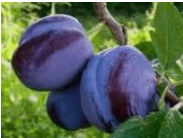
Plum ( Ameixa )