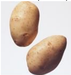
Potato ( Batata )