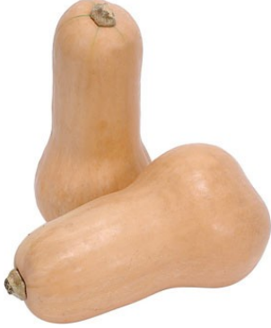
Squash ( Abobora )