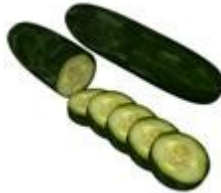
Cucumber ( Pepino )