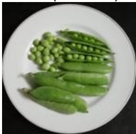
Peas ( Ervilhas )