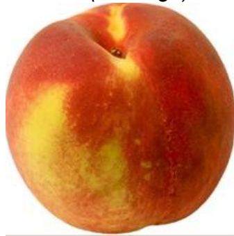
Peach ( Pêssego )