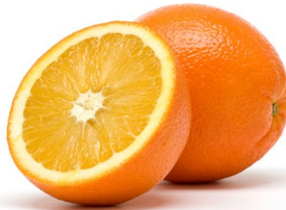
Orange ( Laranja )