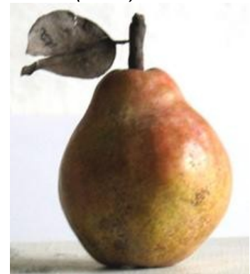
Pear ( Pêra )