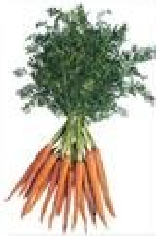
Carrot ( Cenoura )