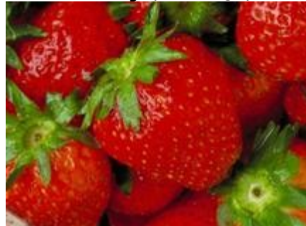
Strawberry ( Morango )